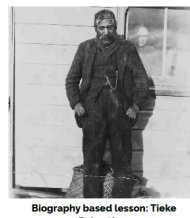
Biography based lesson: Tiekē Pukurākau