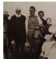
Biography based lesson: Taare Teihoko